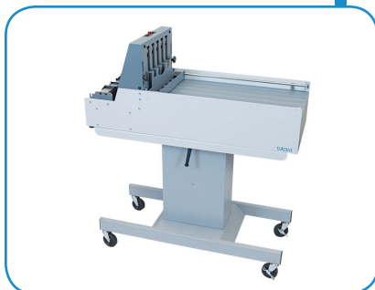
Optional V-Stack36i Vertical Stacker with adjustable-height stand

Formax - New Hampshire, USA www.formax.com