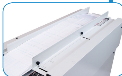
FD 2300-EXT extended air-feed