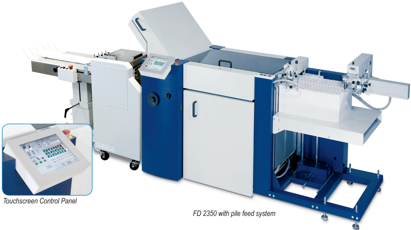
Touchscreen Control Panel