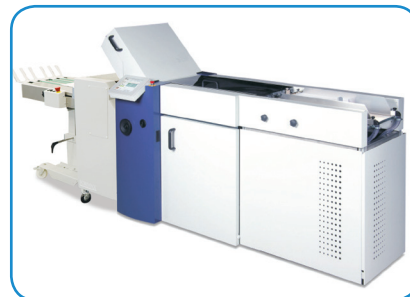
FD 2300 air-feed